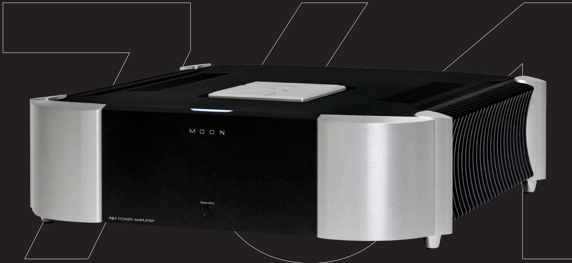
— 761 Power Amplifier —